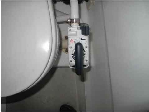
Pump handle in locked position